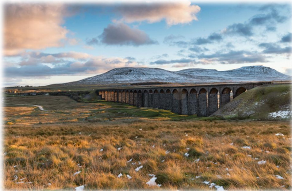
Yorkshire Dales National Park